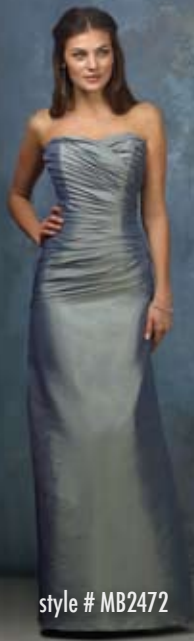
style # MB2472