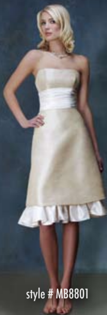
style # MB8801