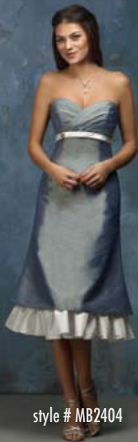
style # MB2404