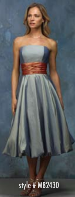
style # MB2430