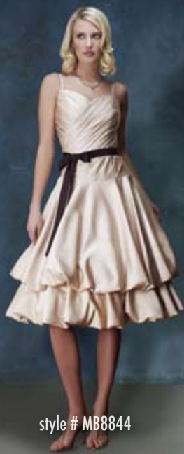
style # MB8844