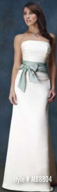
style # MB8804