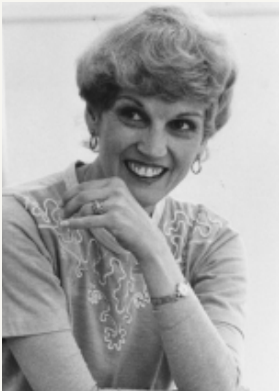
Photograph by David Burckhalter

Market Street Grill-Cottonwood at 6:00 pm